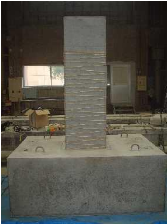
Column wound with CORDOY

When CORDOY is used for seismic retrofitting of an existing RC column, it is wound around the surface of the column. The concrete jacketing was expected to protect CORDOY during service stage and to effectively transfer stress to CORDOY just after cracking. The ductility of the RC column was improved.