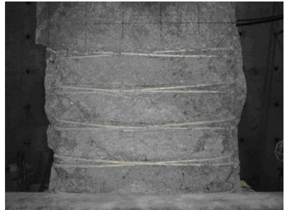
CORDOY did not rupture after loading test.